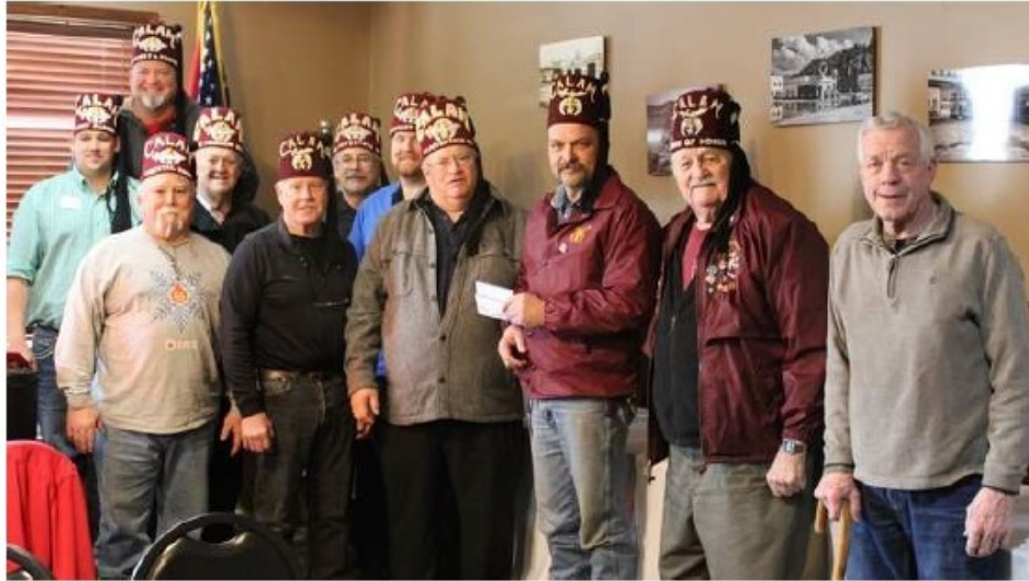
On Wednesday, Feb. 26, Shriners from the Moyie Shrine Club hosted other traveling Shriners to attend the ceremonial handing over the checks to the Potentate.