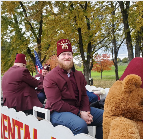
Calam Shrine Band in the Lewiston Veteran’s Day Parade.