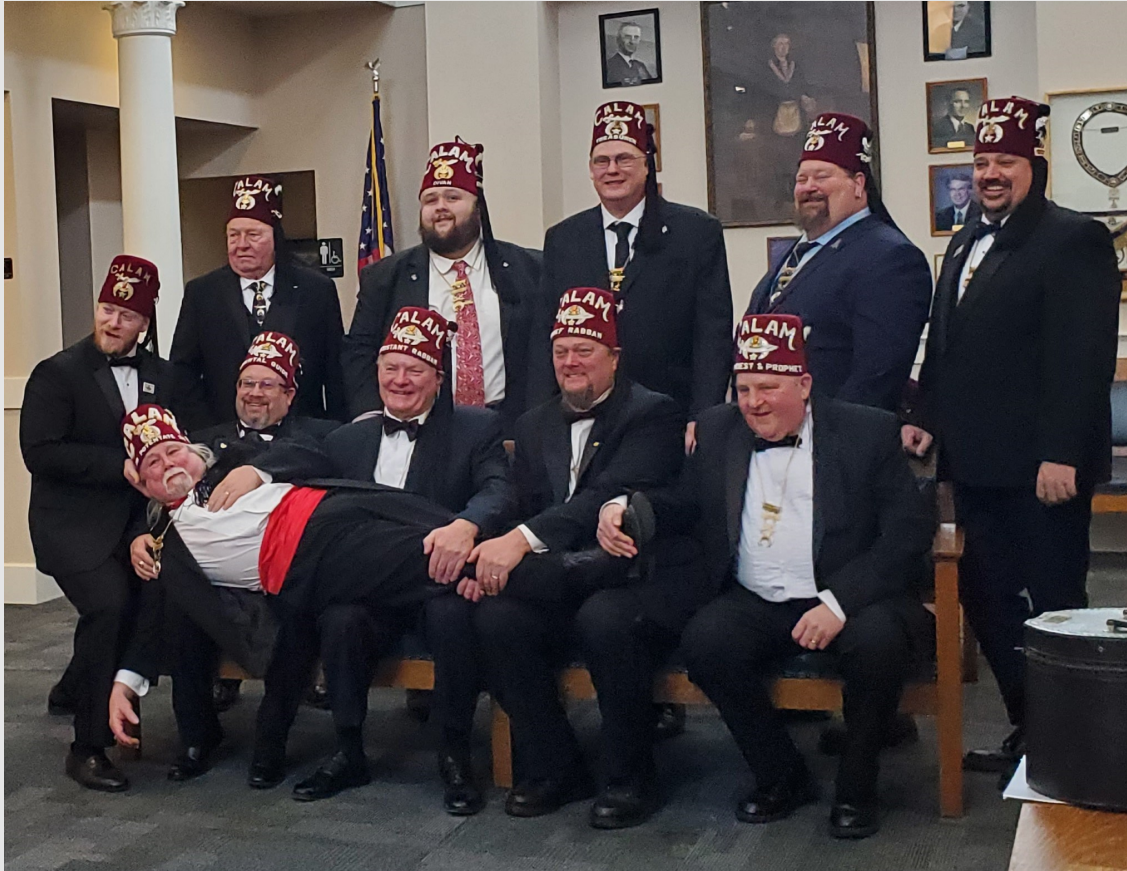
The Divan prepares to carry the Potentate...just as it did in 2023!