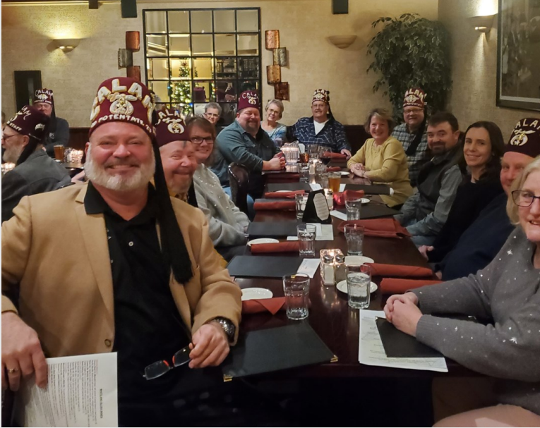
Smiles abound at the Calam Christmas dinner. A year well done!