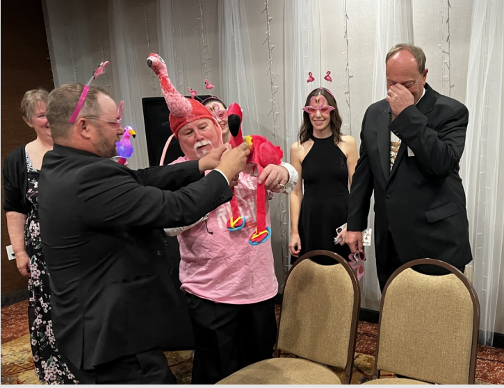
The Klown's Flamingo Degree was a crowd affair at the Potentate's Ball.