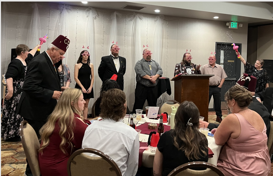
The newest members of the Klown's Flamingo Flock.