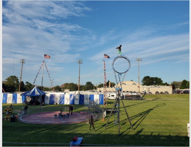
A death defying acrobat navigates the giant wheel at the circus.