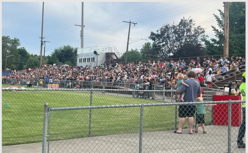
Two nights of sell-out crowds attend the Calam Shrine Circus at Bengal Field.