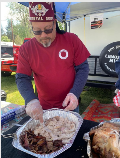
Celebrity OG Rowden prepares smoked turkey and bacon for the Winchester faithful.