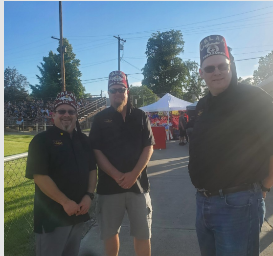
Calam Divan members at the circus in Lewiston.