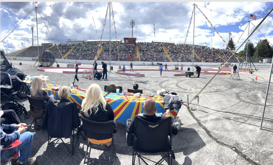
A packed stadium at the Calam Shrine Circus in Post Falls!

Between Jingles and I, we gave away eight rolls of stickers and somewhere in the neighborhood of 500 free tickets. Both Jingles and I had to get the rust off our dancing shoes to warm up the crowd for the shows. I am still way rusty!! It has been a long time since we had to dance!!! There were elephants, camels, buffaloes but no bears oh my! We saw tons of smiles, laughs, and giggles in the crowd!