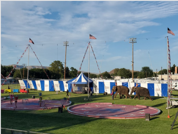
Circus elephants get the show started early for children gathering in the stands.