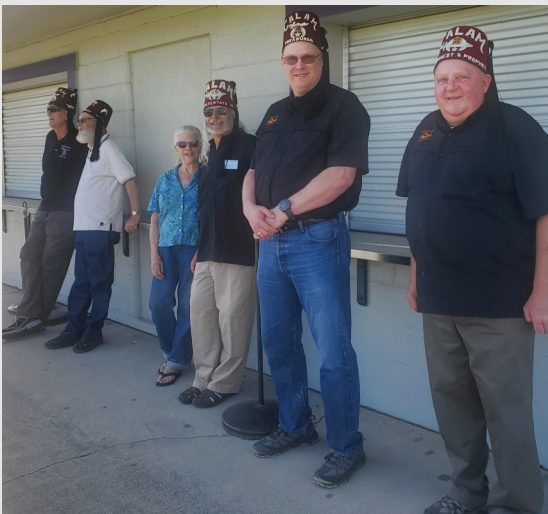
Calam Nobility greet the circus crowds of children and parents.