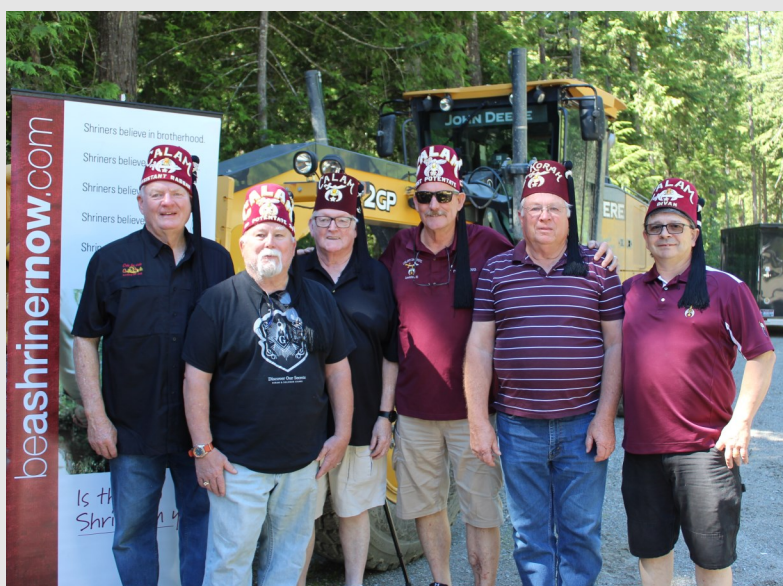
Calam Divan and Past Potentates gather in Sandpoint at the fruitful ATV fundraiser