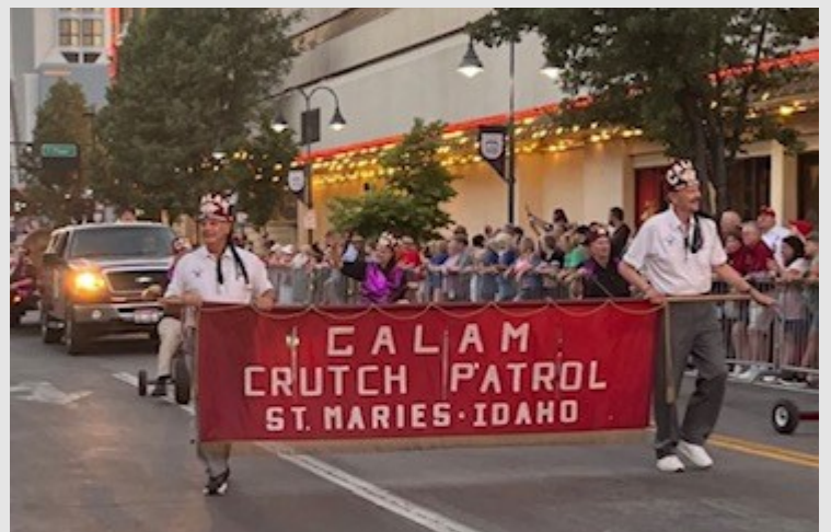
The St. Maries Shrine Club proudly represents Calam at the Imperial Potentate's parade!