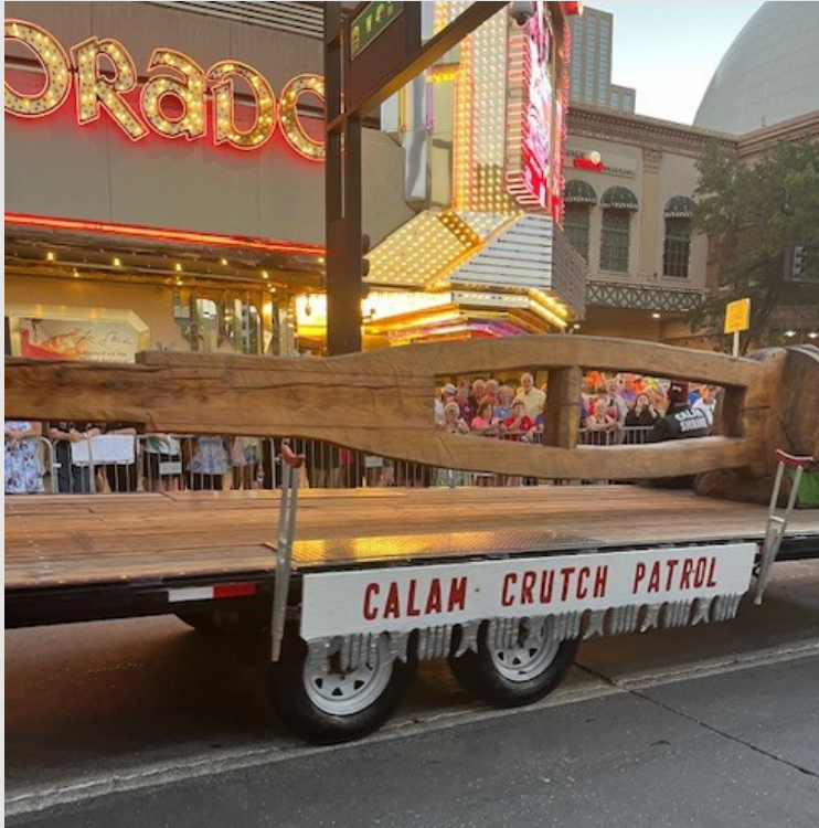
The Calam Crutch Patrol staged and ready for the Reno parade.